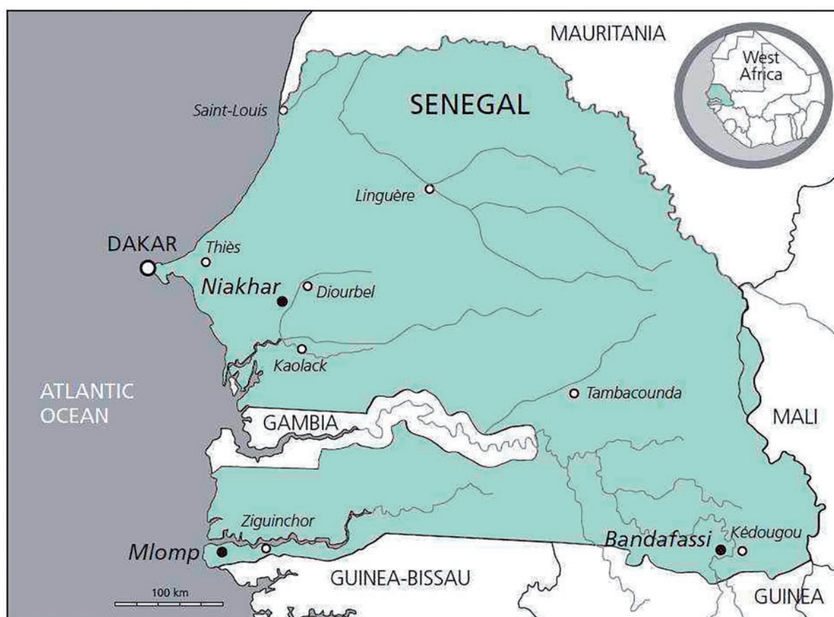
Figure 1. Location of Mlomp and the two other HDSS sites in Senegal.

The site is in a Guinea savannah and mangrove ecological zone. The area has a rainy season from June to October and a dry season from November to May, and had average annual rainfall of 1250 mm over the period 1985–2010.