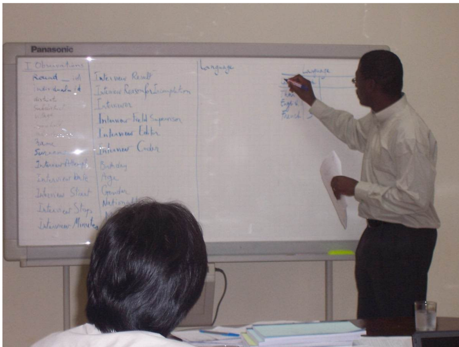
A database expert from South Africa working with the Kachanaburi DSS team