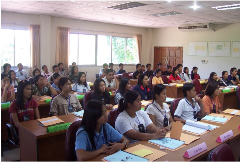
Interviewers undergoing training at the Kanchanaburi Field Station.